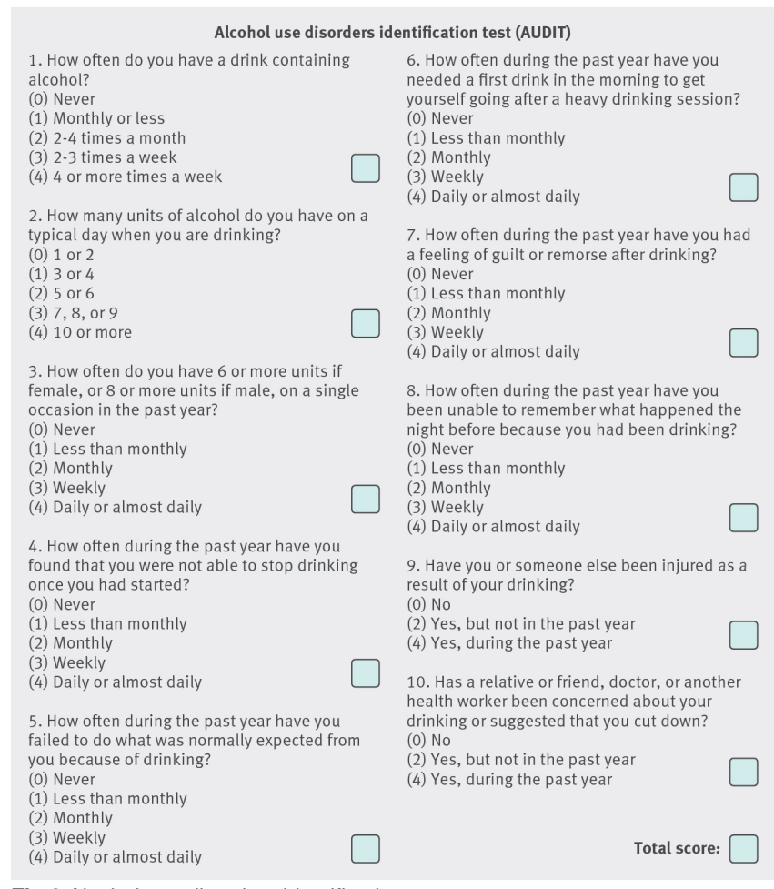
Fig 2 Alcohol use disorders identification test